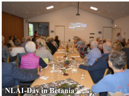
NLAI-Day in Betania

In September, we were invited to give a lecture on the work of NLAI at the Red Cross in Kjellerup. We also attended Mosaik's super-day session in Mariager on September 16 -17. The teaching was very inspiring as it was good to meet pastors and leaders from all over Denmark. On October 2nd we had a very good gathering of helpers and friends of NLAI. We enjoyed a time of singing, listening to different people sharing exciting stories about their travels and practical help that they had given whilst at NLAI in Kenya. We also enjoyed a meal together.