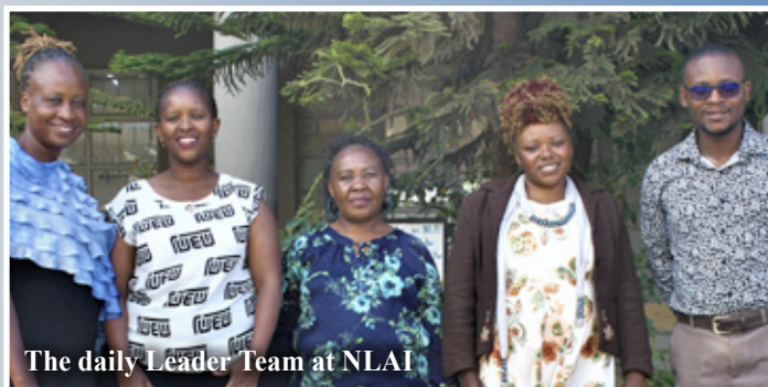
The daily Leader Team at NLAI