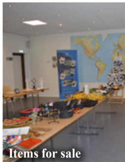
Items for sale