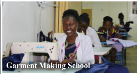
Garment Making School

In the same place as the big school, NLAI runs a Garment Making school with 47 students taking a 4-year education. The school not only provides education but offers bible studies and management training to