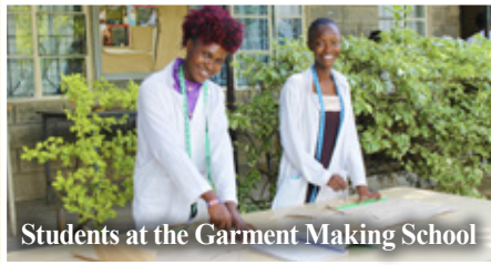
Students at the Garment Making School