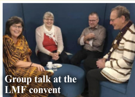
Group talk at the LMF convent

On the weekend of 8 - 10 October, we had the pleasure of attending the national convention of LMF in Odense (Teachers' Mission Federation). It was a good experience to be together with Christians from different churches,